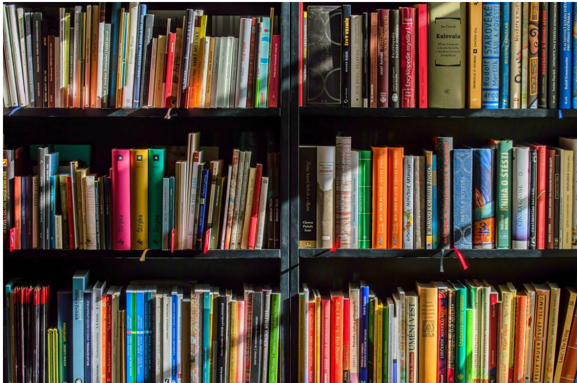
Fig. 2.1 A copyright-free image of a bookshelf illustrating the positioning of a figure within a chapter